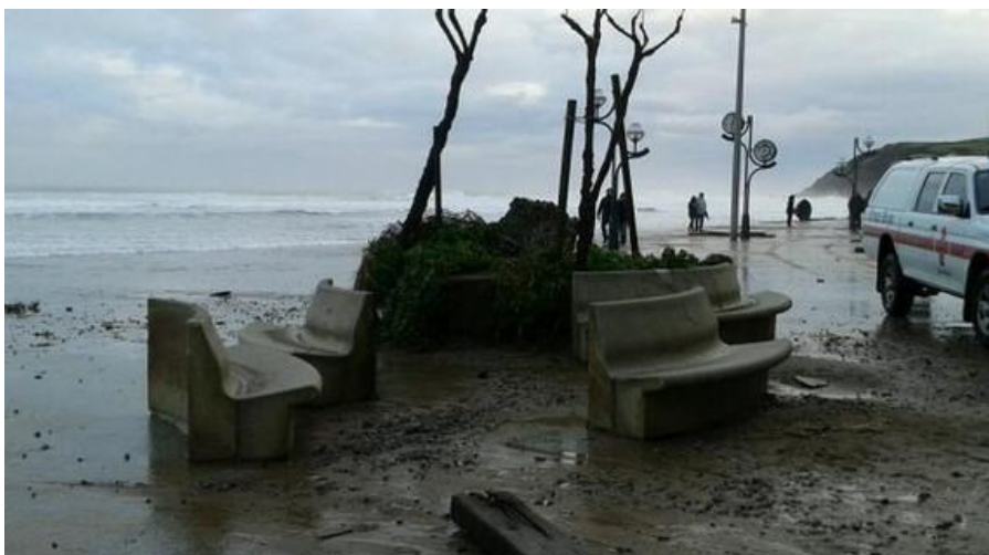
Zarautz, February 2014 (Lorena Lopez de Lacalle).

Table 1 gives an overview over a wide range of adaptation options and shows how these are complemented by development and transformational change of societies and