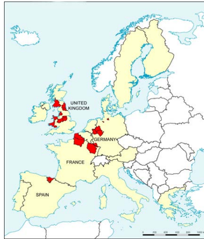
Figure 1: Old Industrial Regions in the Largest European States